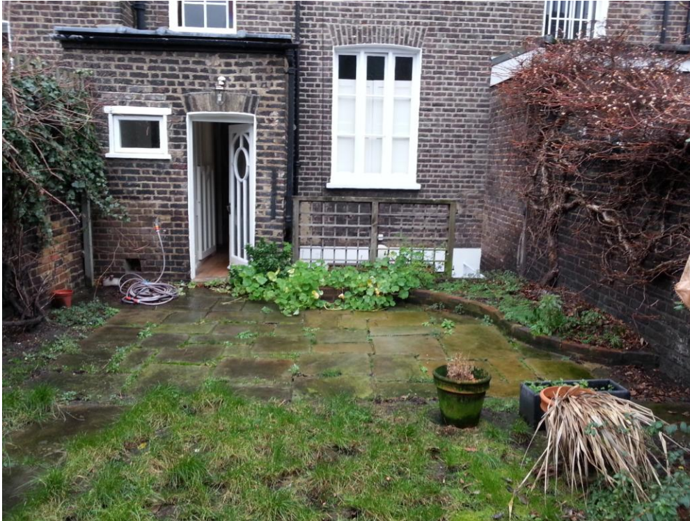
Rear 3: Rear garden patio and rear lightwell