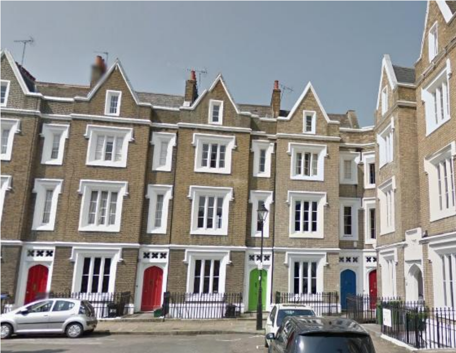
Photo 1: Front elevation of No. 29 Lonsdale Square and adjoining properties