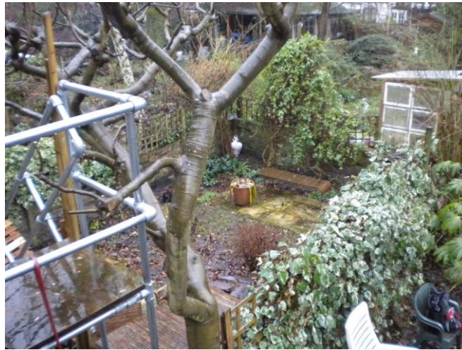
ABOVE: Relationship to rear garden of 32 brecknock road