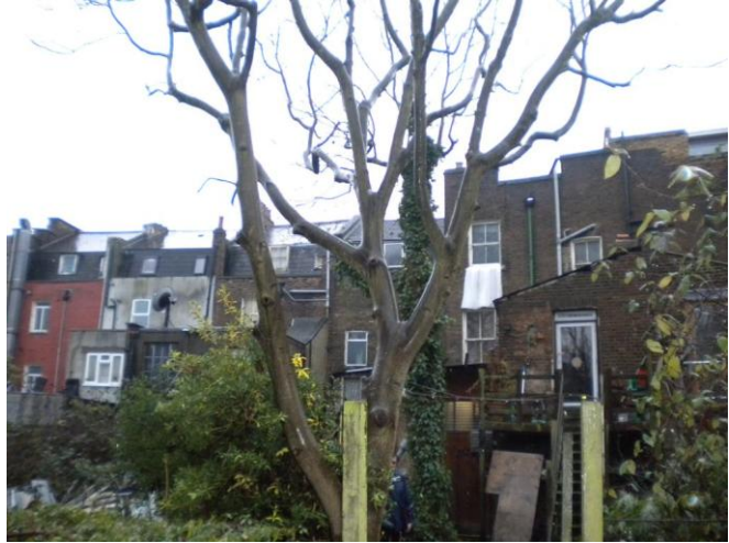
ABOVE: Terrace to the north