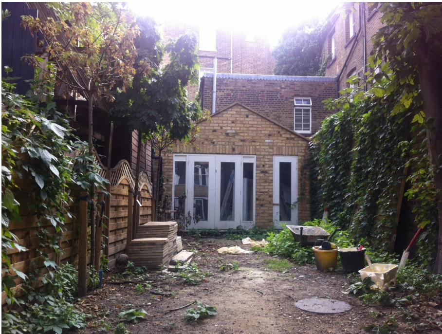
3.2 Photo 2: Looking towards summerhouse, three TRN trees shown on left.