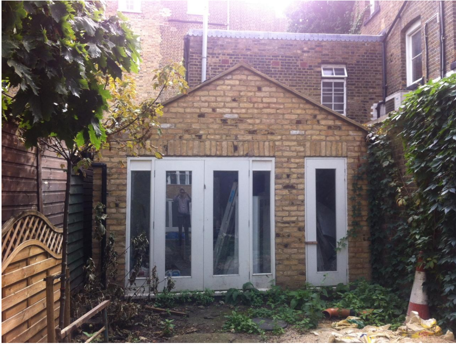
3.1 Photo 1: Summerhouse