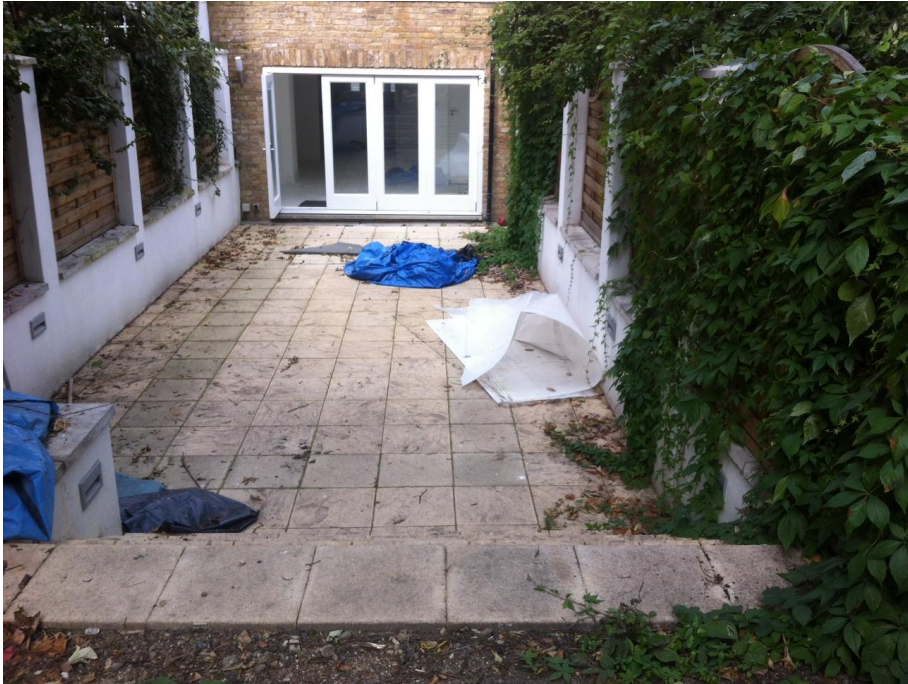
3.3 Photo 3: Looking towards the main dwelling.