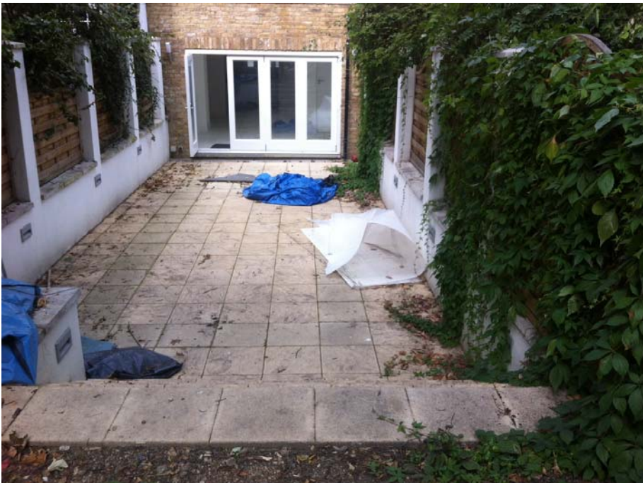
3.3 Photo 3: Looking towards the main dwelling.