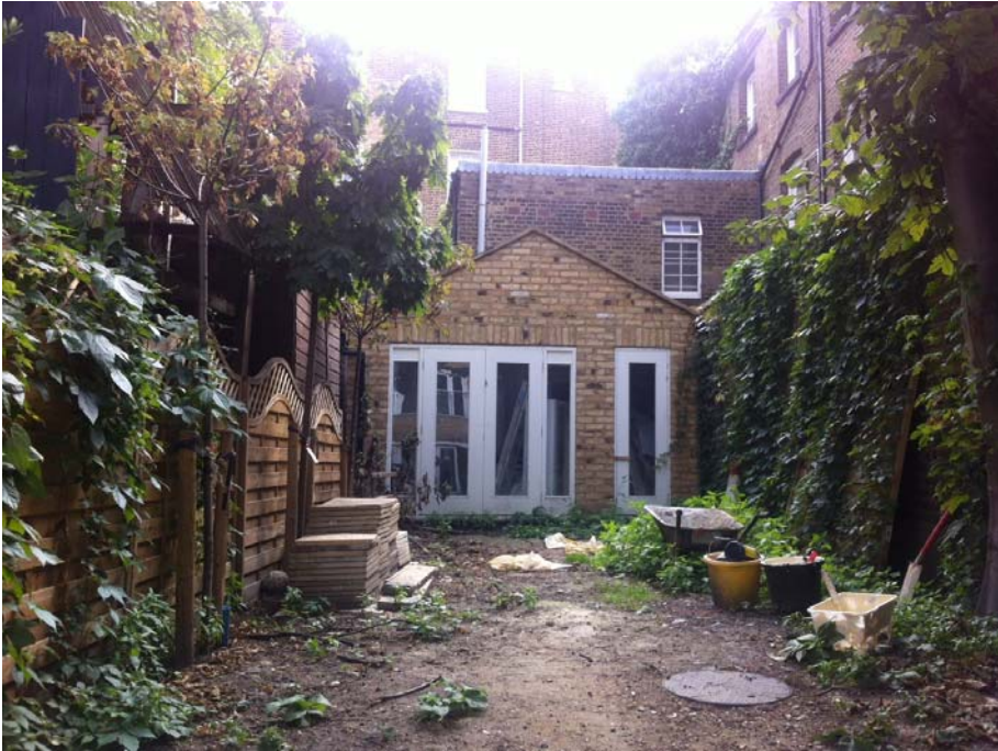
3.2 Photo 2: Looking towards summerhouse, three TRN trees shown on left.