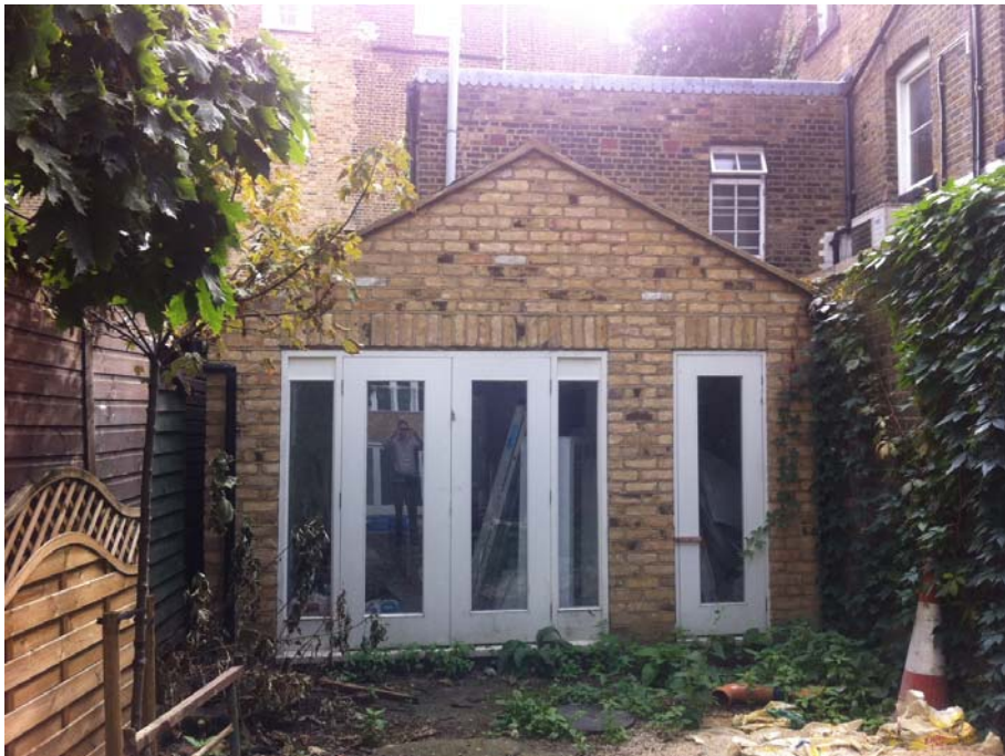
3.1 Photo 1: Summerhouse