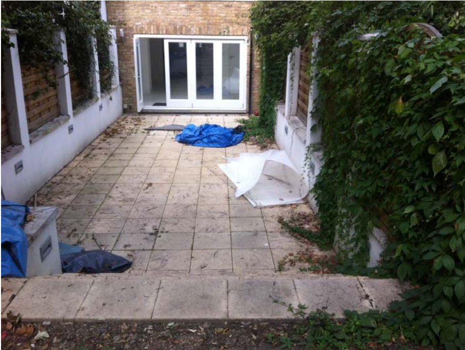
3.3 Photo 3: Looking towards the main dwelling.