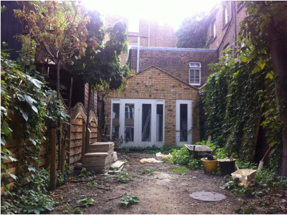
3.2 Photo 2: Looking towards summerhouse, three TRN trees shown on left.