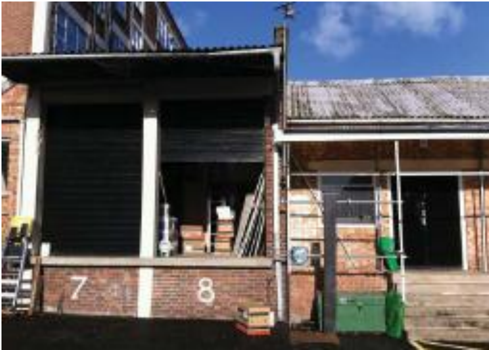
Existing buildings to the rear of No 58 Highbury Grove