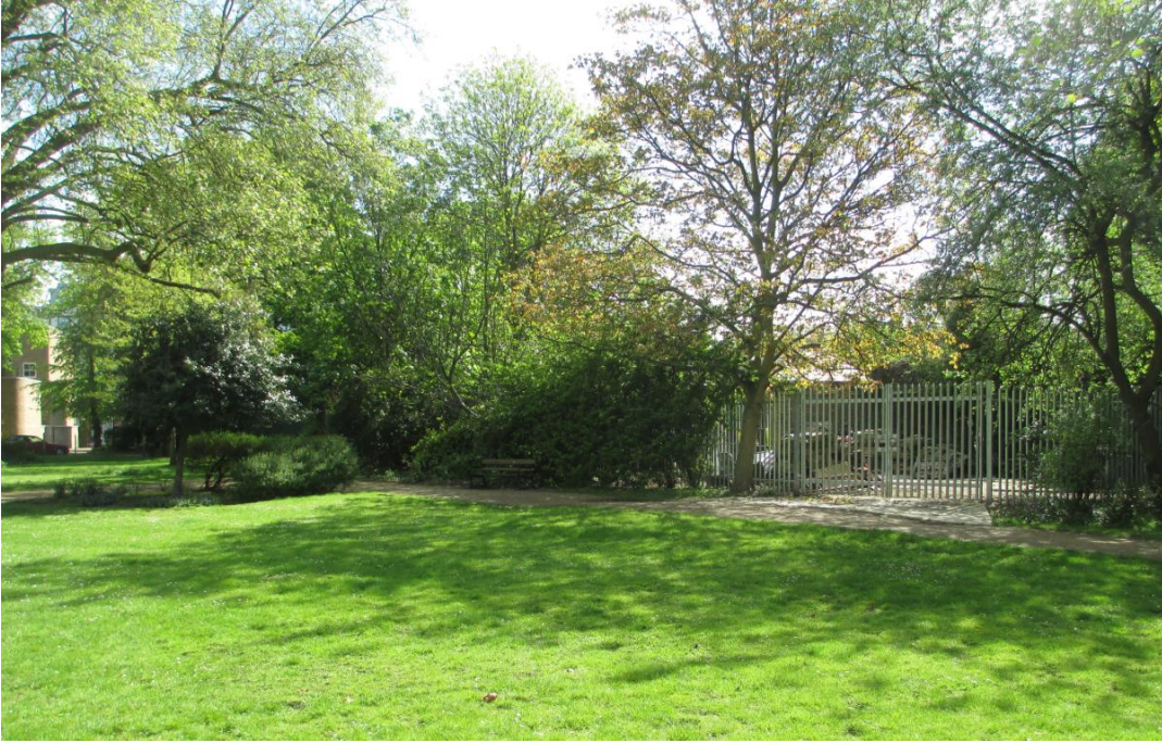
View from within park: