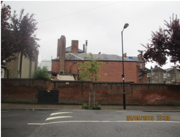
VIEW OF SITE FROM CANNING ROAD