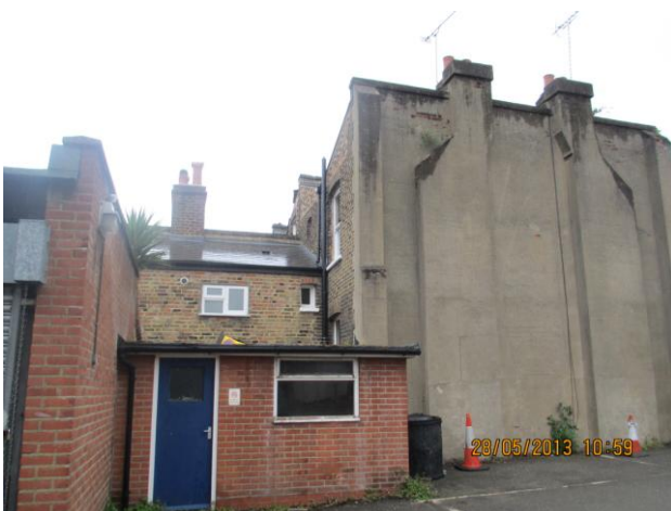
REAR OF SITE LOOKING TOWARDS NO.41