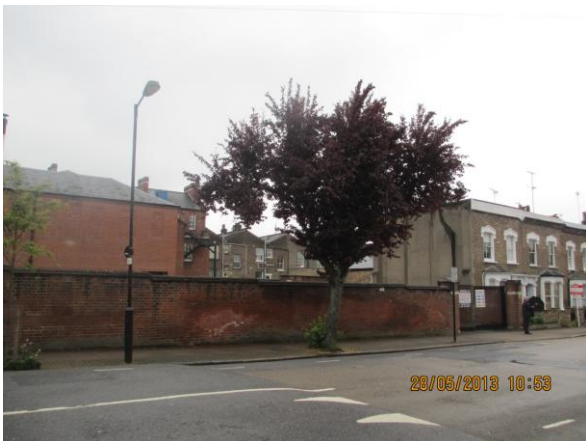
VIEW OF SITE LOOKING TOWARDS NO.41 CANNING ROAD