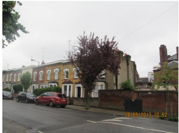
VIEW OF SITE LOOKING TOWARDS NO.21 CANNING ROAD