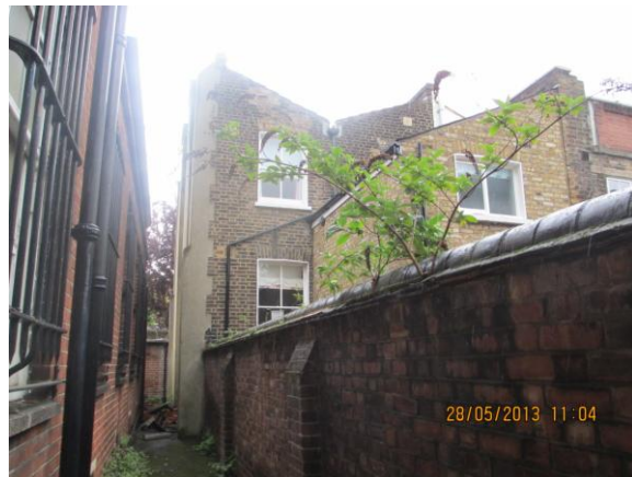
REAR OF SITE LOOKING TOWARDS NO. 27 CANNING ROAD