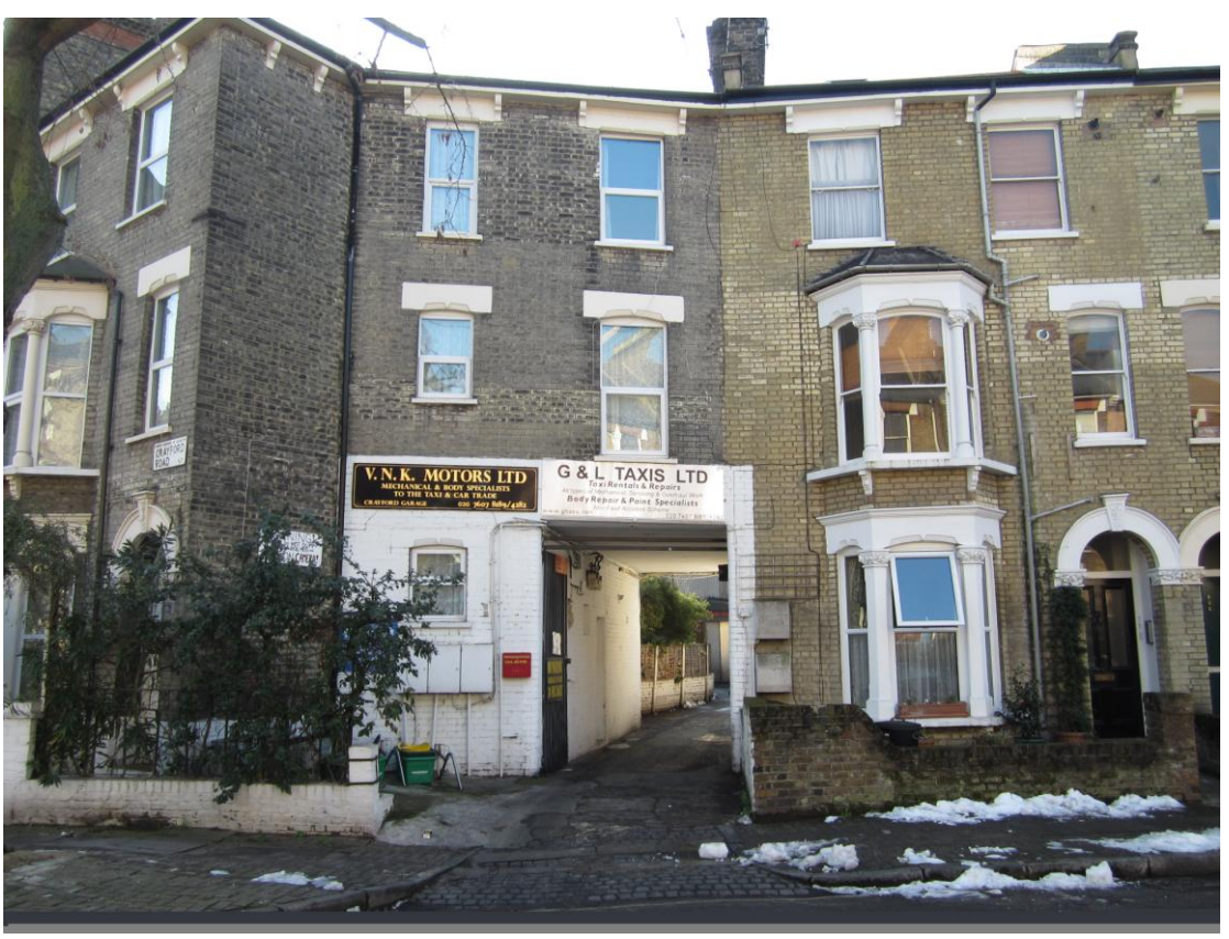
Entrance to site from Crayford Road