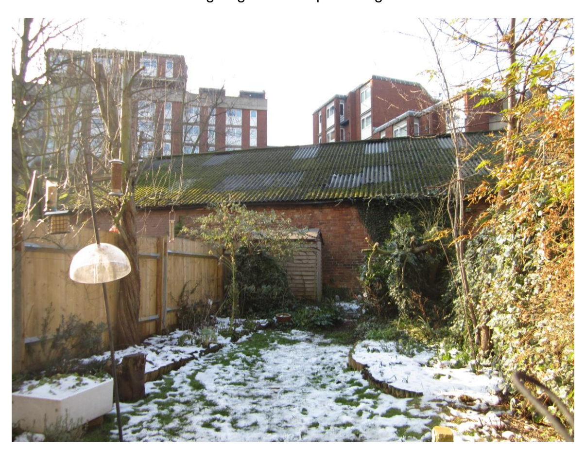
Northeast side elevation of garage workshop building