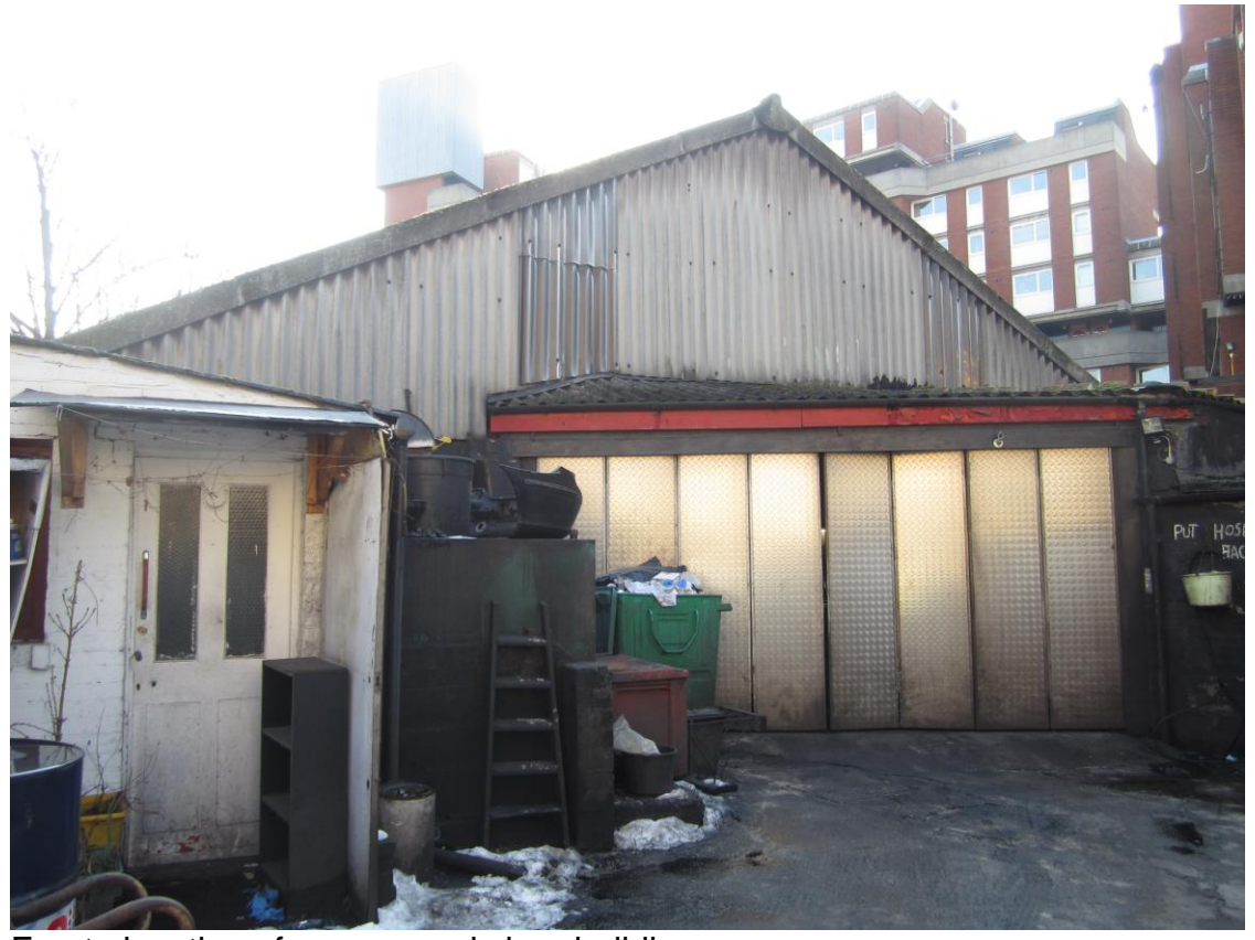
Front elevation of garage workshop building