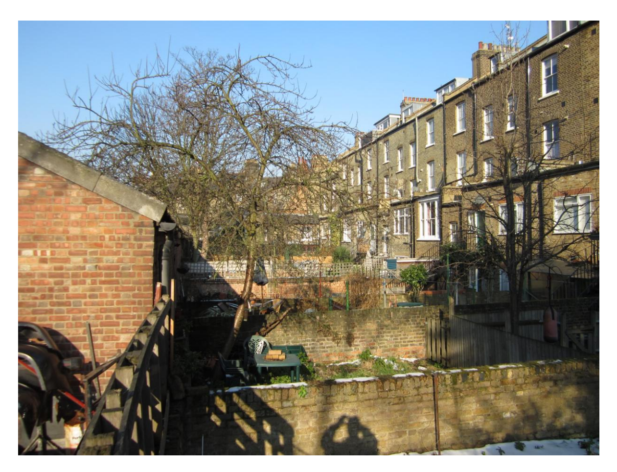
View across rear gardens of properties fronting Crayford Road