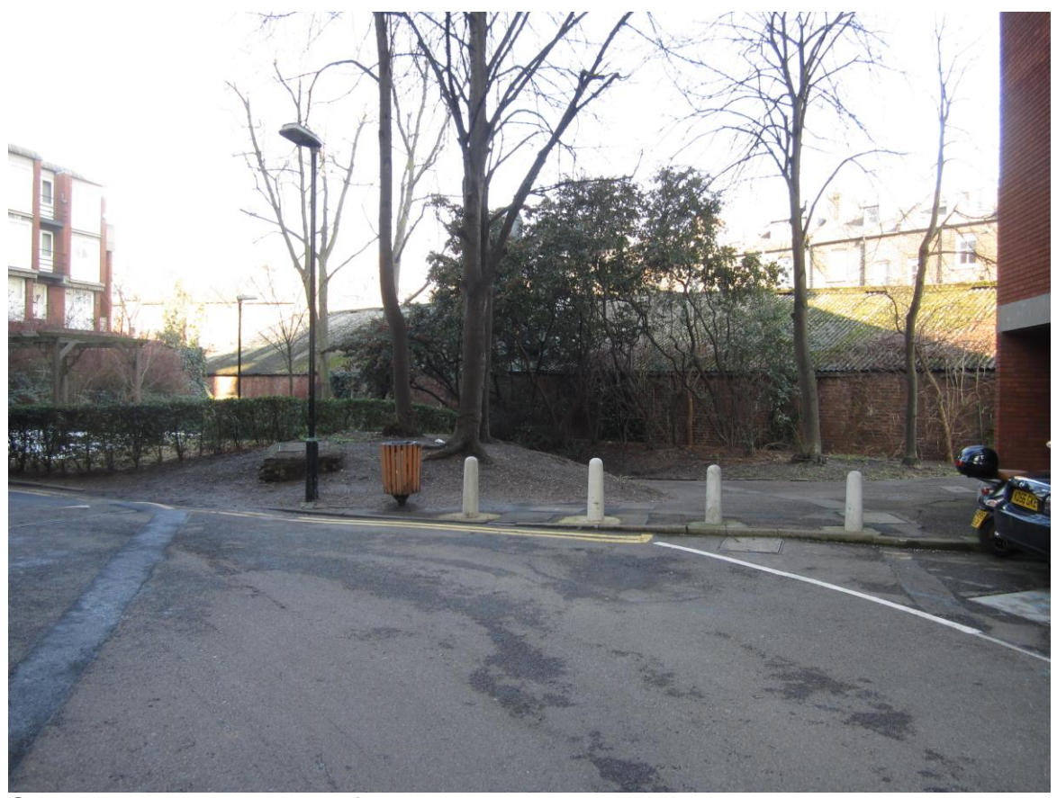
Southwest side elevation of garage workshop building