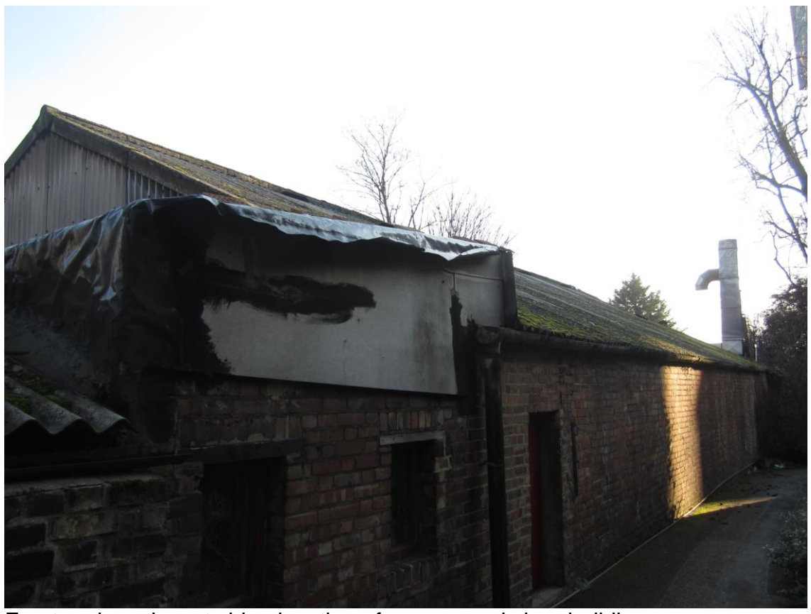
Front and southwest side elevation of garage workshop building