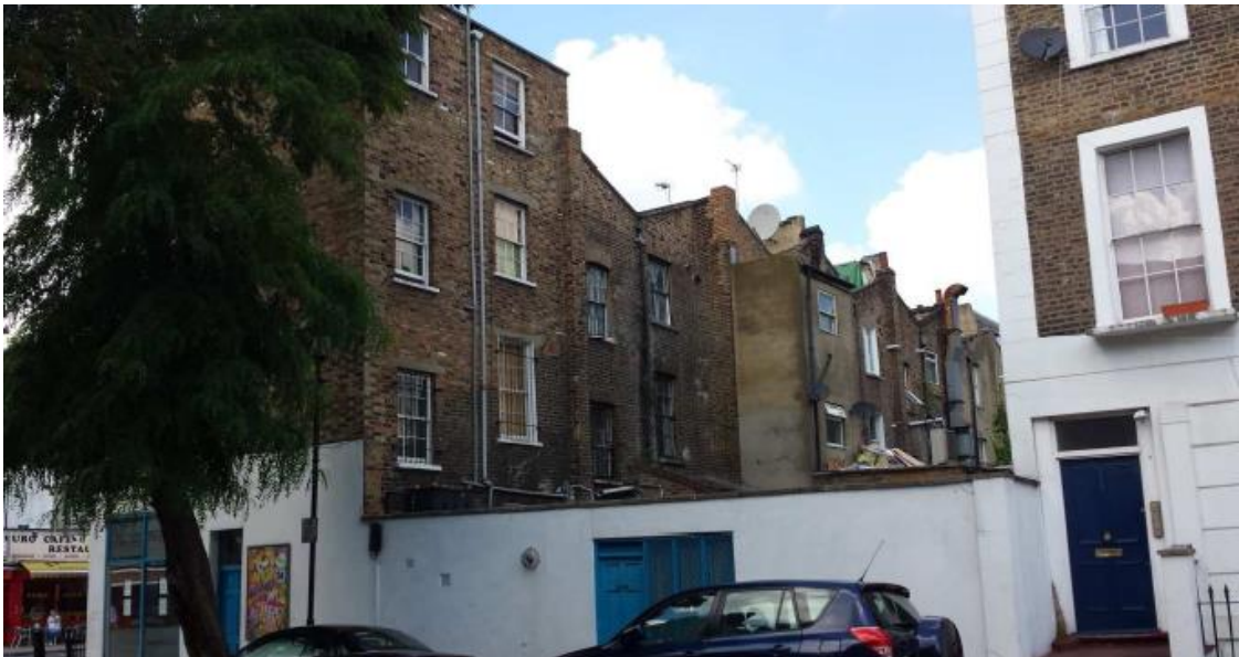
Image 3: Rear Elevation of Caledonian Road taken from Bridgeman Road