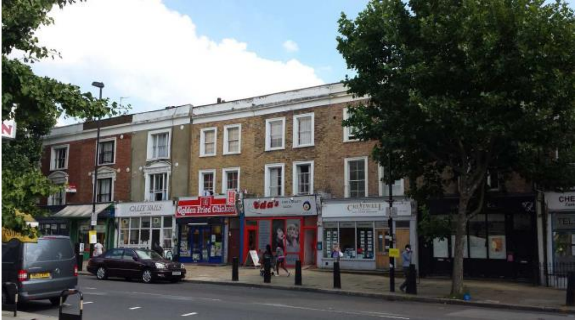
Image 2: Front Elevation of the application site and terrace at Caledonian Road