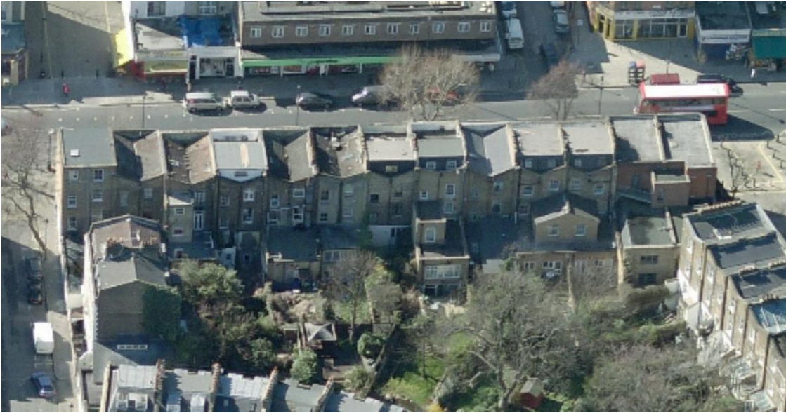
Image 1: Aerial photograph showing the terrace of 13 properties, including No. 348 Caledonian Road (third from the left).