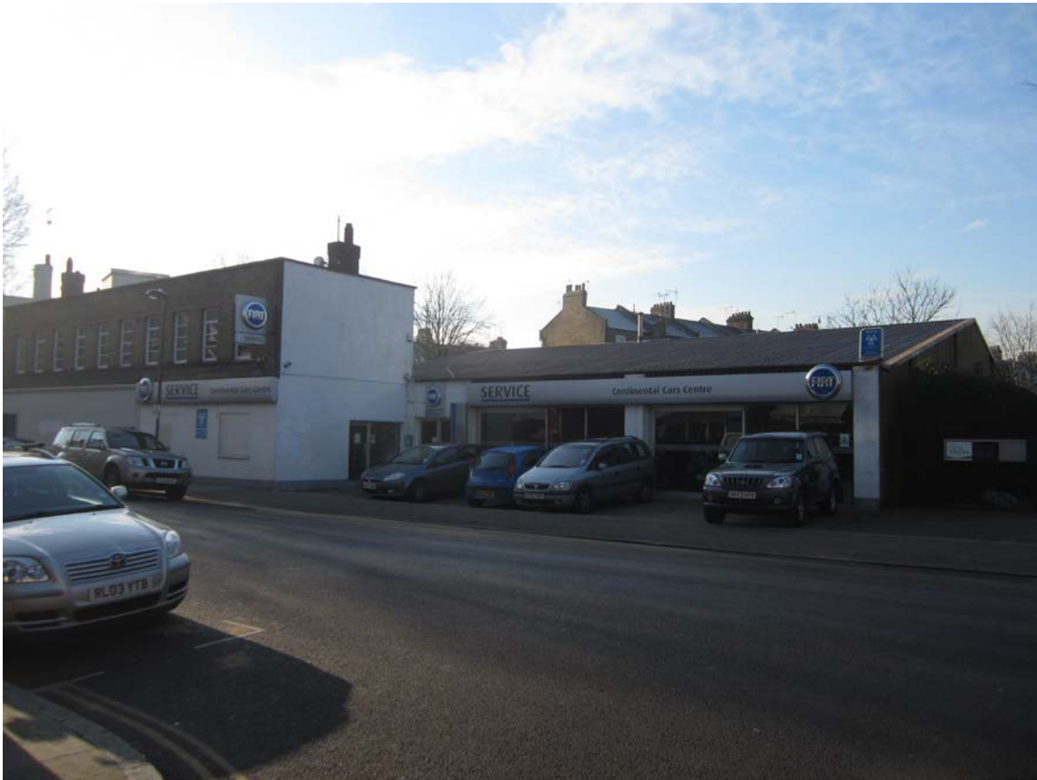
Front (east) elevation