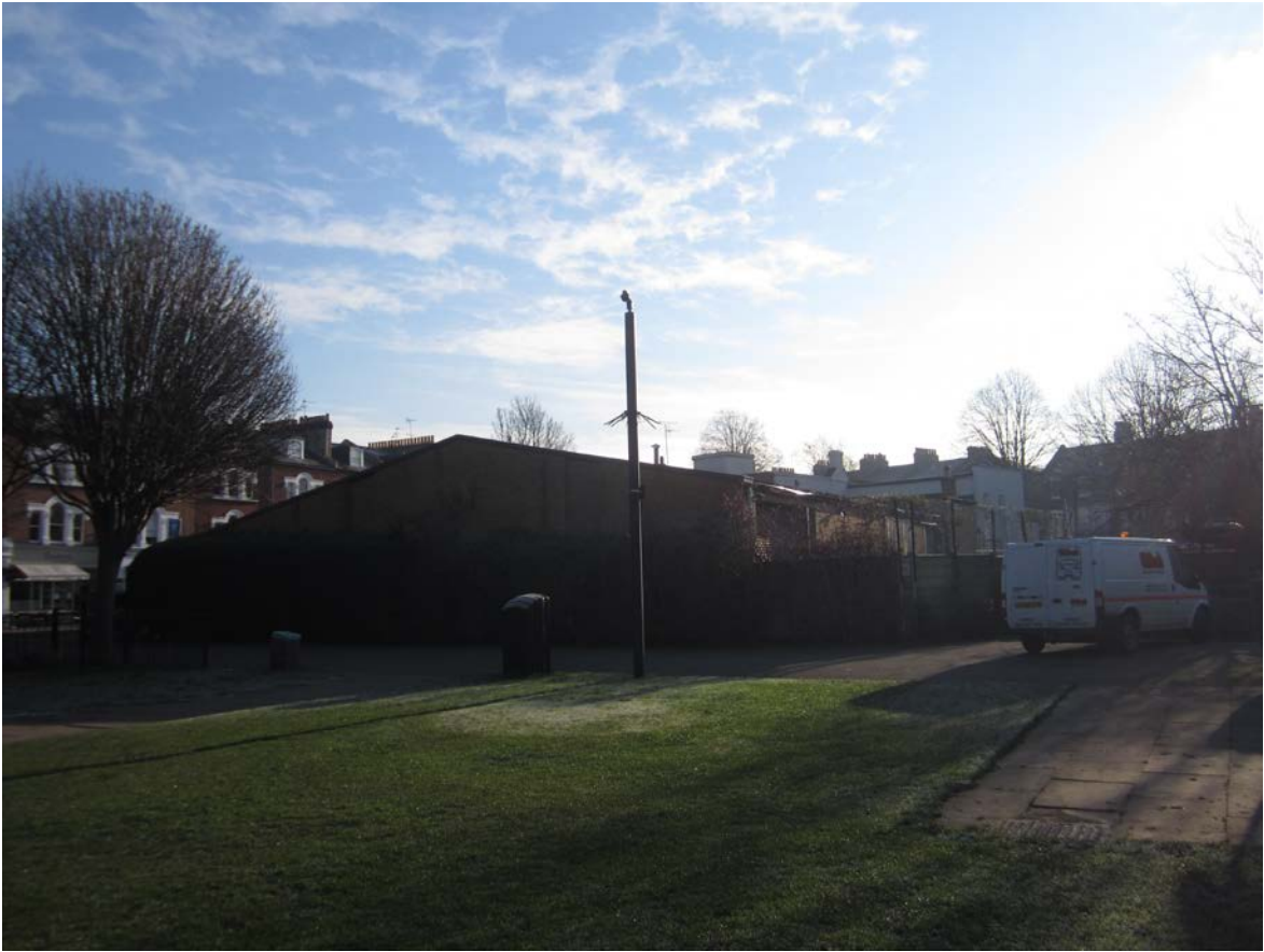
North side elevation