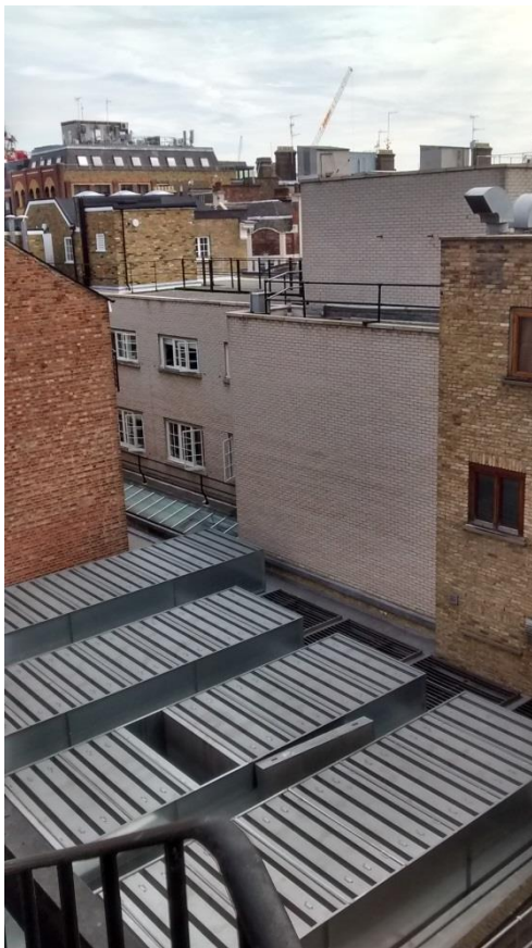
Image 3: View of Existing Data Centre Plant and part of rear façade of 24 Epworth Street