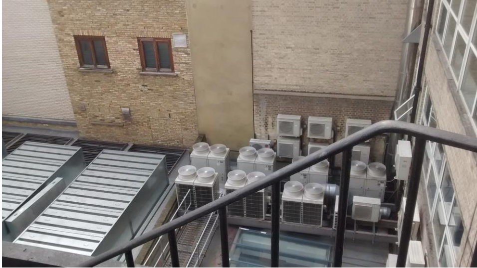
Image 2: View of the Rear of the building from existing fire escape including existing A/C plant and plant serving data centre