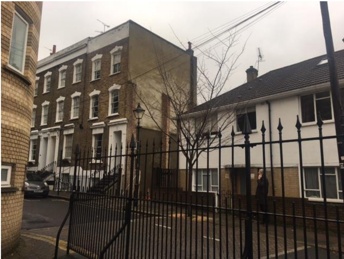
View of existing terrace