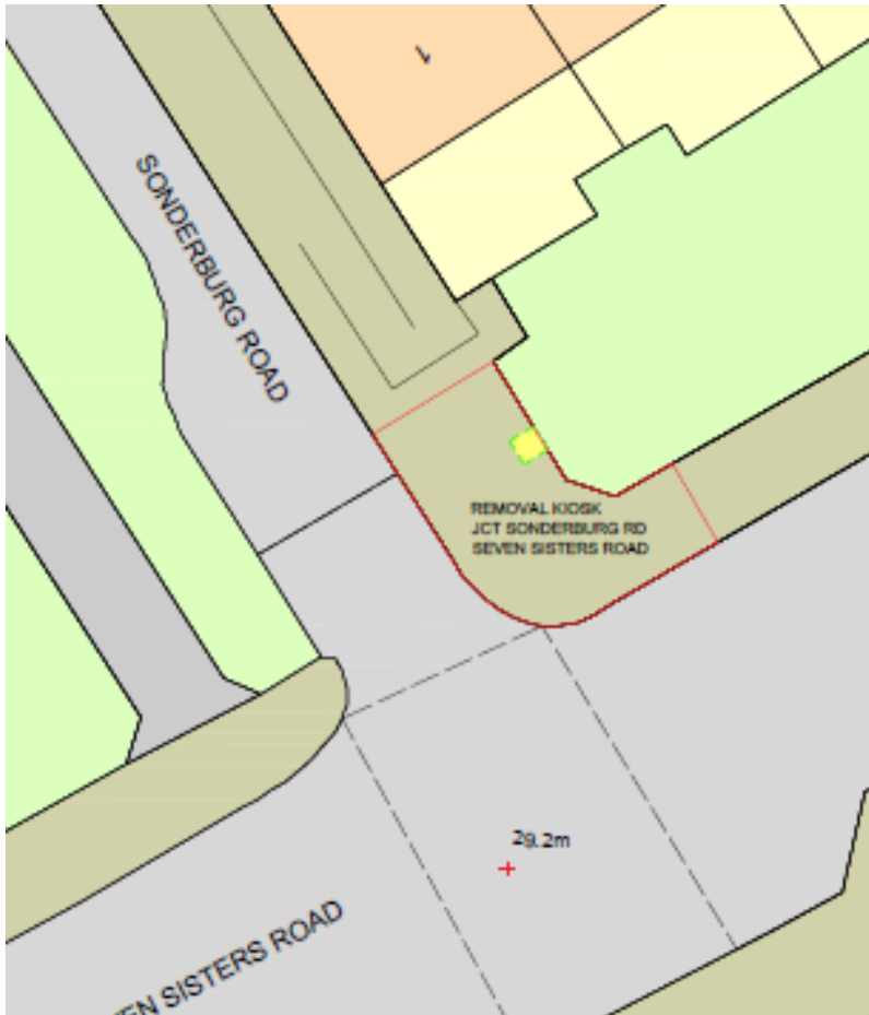
Image 6: Site plan showing the location of the additional phone box which would be removed prior to commencement of the works.