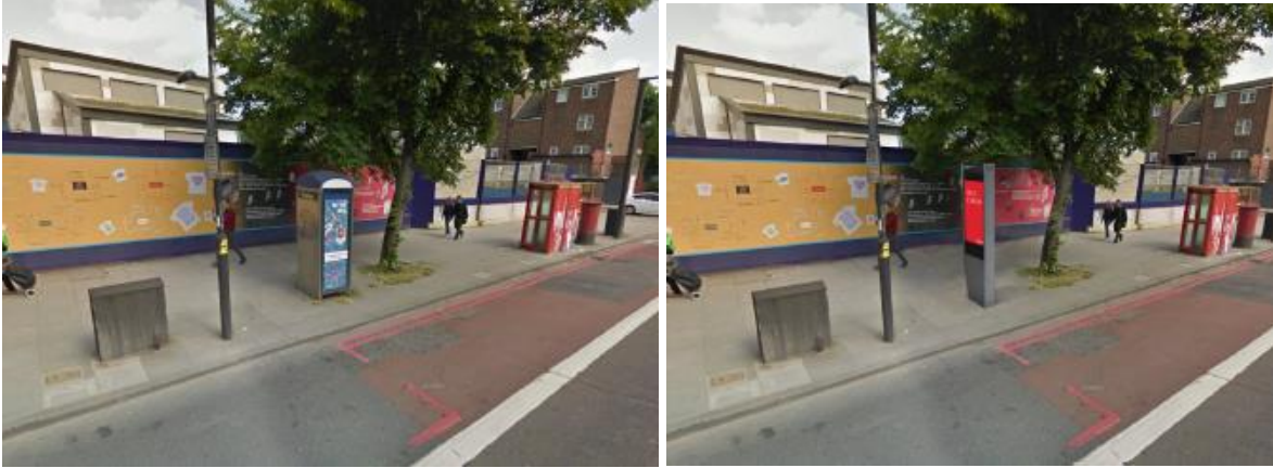
Images 4 and 5: Existing Photographs of Site and Proposed CGI Views