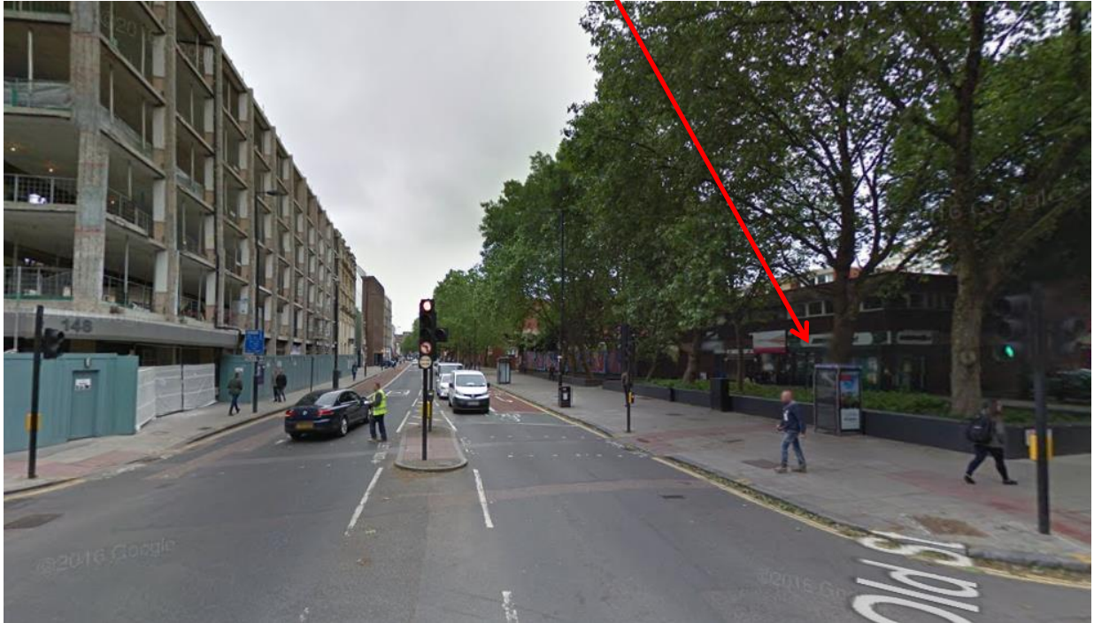
Image 3: View of existing BT phone box looking west along Old Street towards St Lukes Close