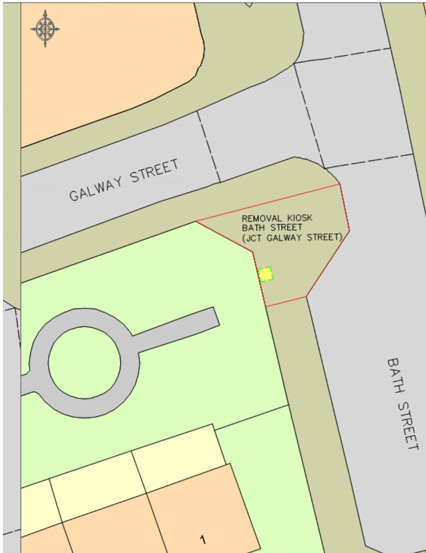
Image 7: Site plan showing the location of the additional phone box which would be removed prior to commencement of the works