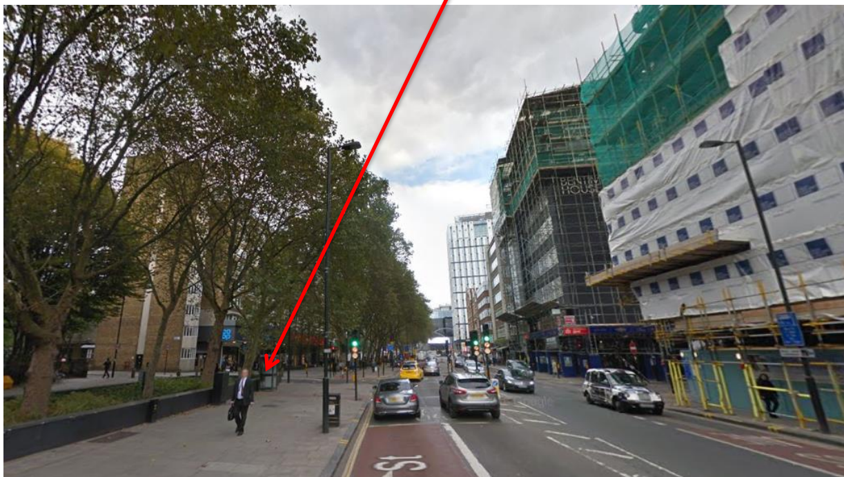
Image 2: View of existing BT phone box looking east along Old Street towards Old Street roundabout