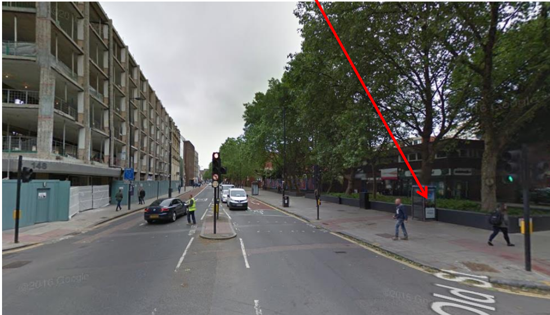
Image 3: View of existing BT phone box looking west along Old Street towards St Lukes Close