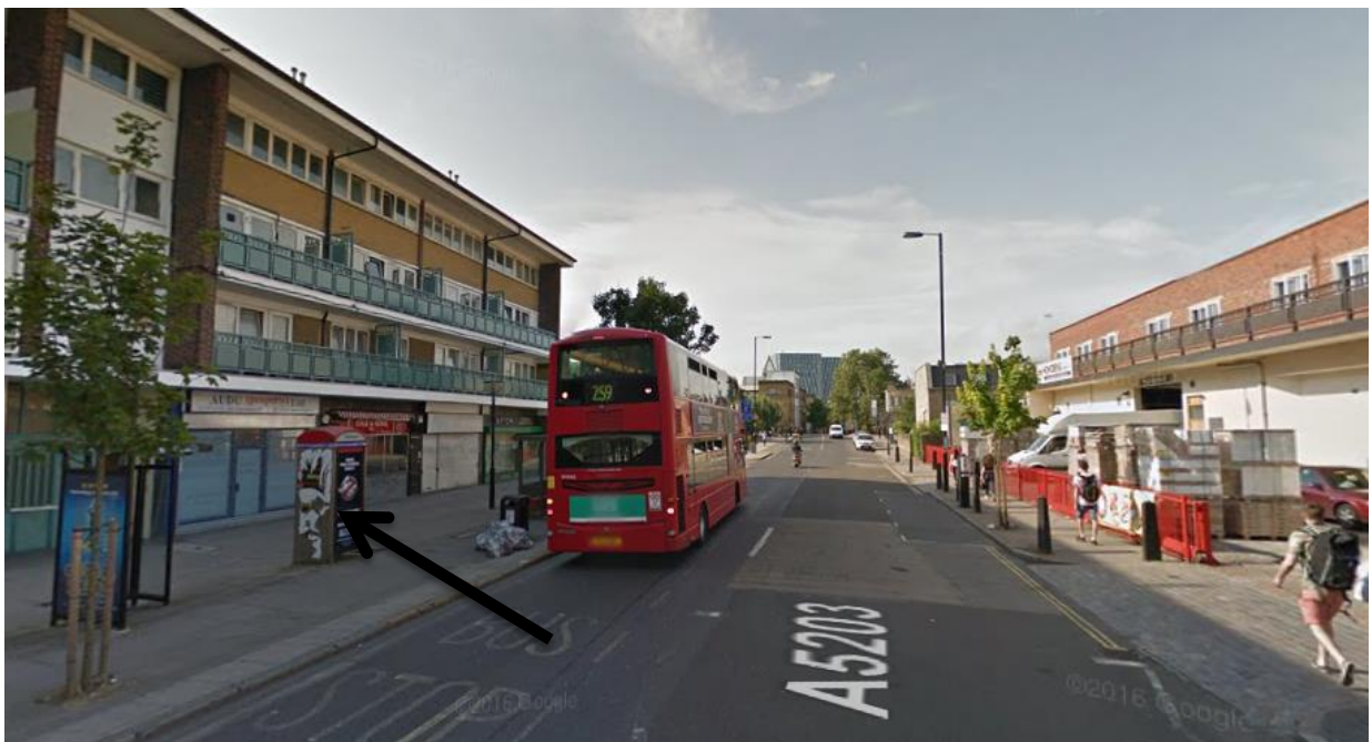
Image 2: View of existing BT phone box looking south along Caledonian Road towards Carnegie Street