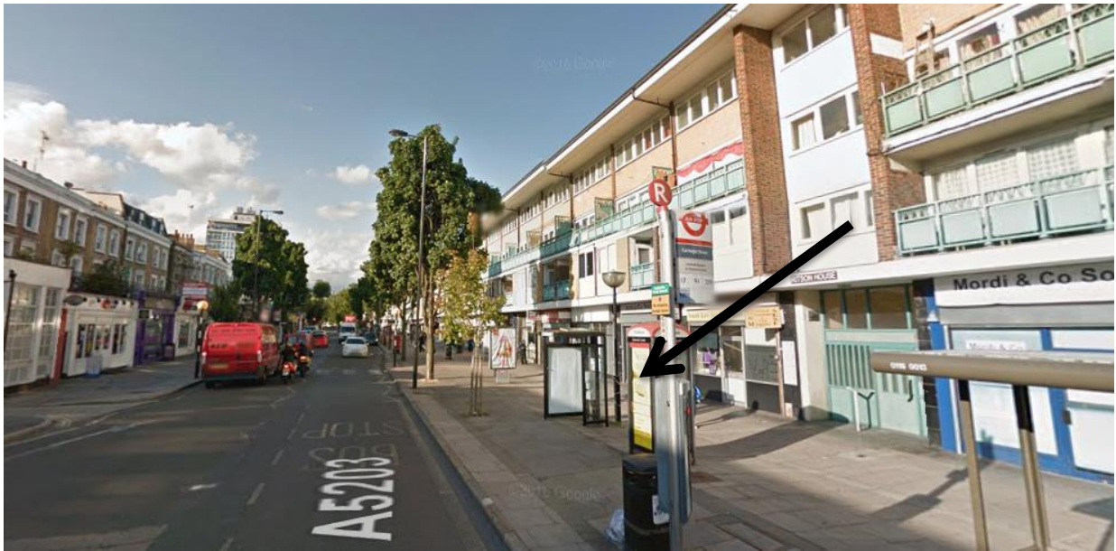
Image 3: View of existing BT phone box looking north along Caledonian Road towards Copenhagen Street