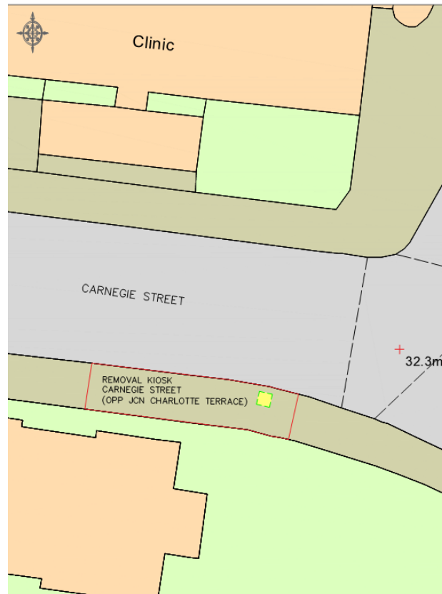
Image 7: Site plan showing the location of the additional 2 phone boxes which would be removed prior to commencement of the works.