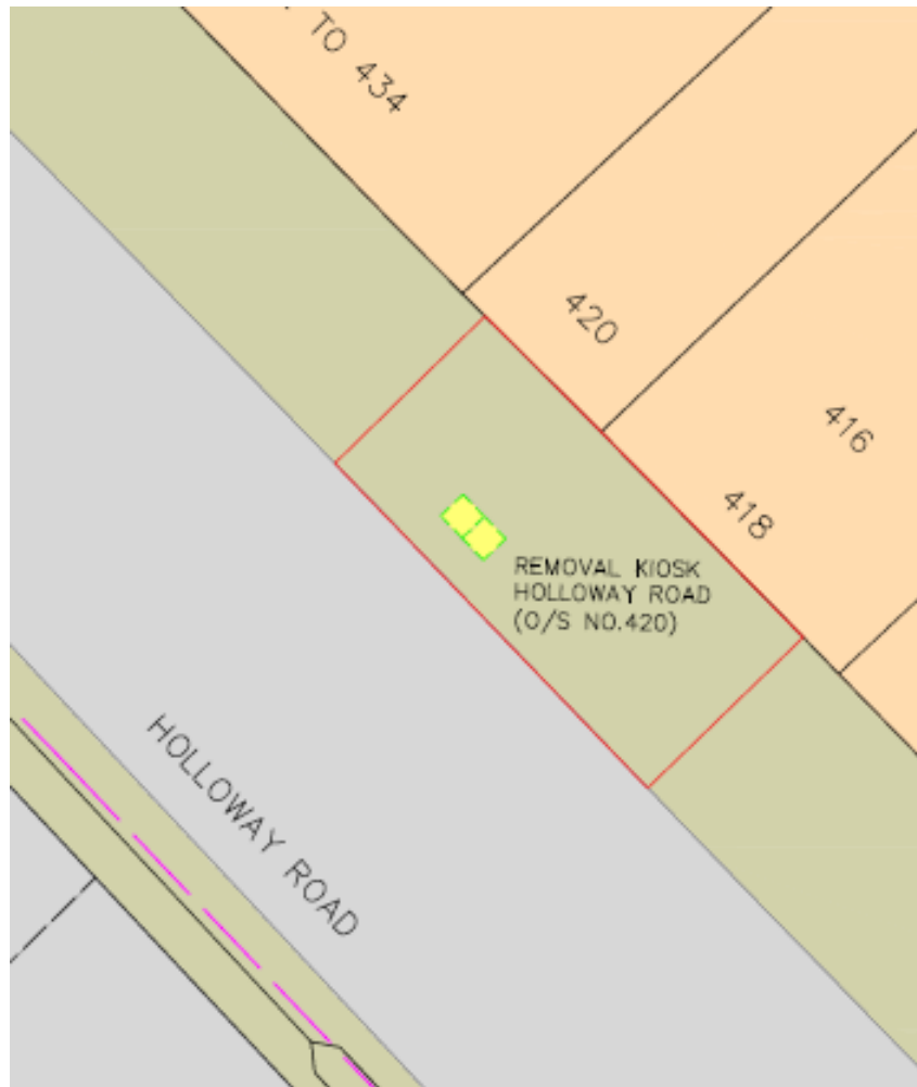
Image 6: Site plan showing the location of the additional 2 phone boxes which would be removed prior to commencement of the works.