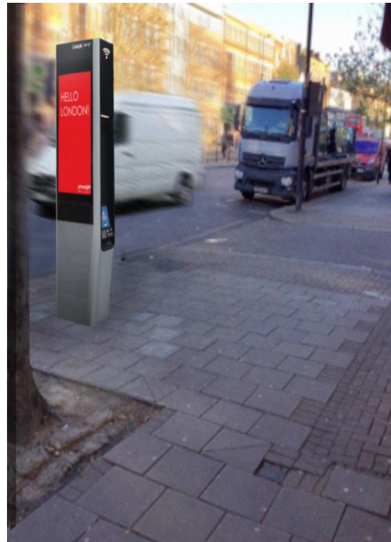
Images 4 and 5: Existing Photograph of Site and Proposed CGI View of Site