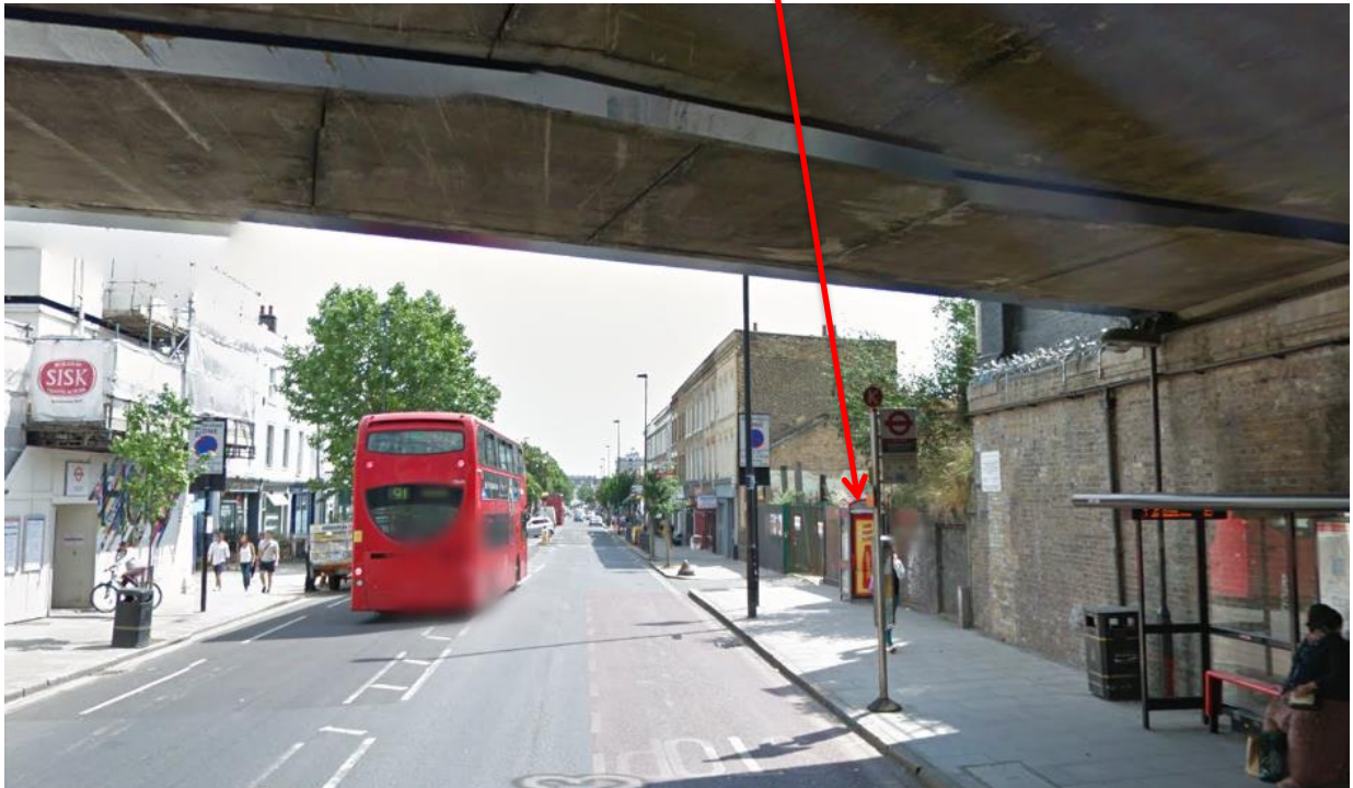
Image 2: View of existing BT phone box looking south along Caledonian Road towards Lyon Street