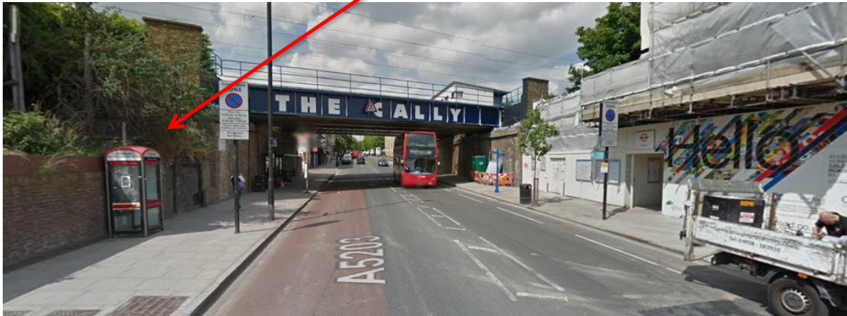
Image 3: View of existing BT phone box looking north along Caledonian Road towards the bridge