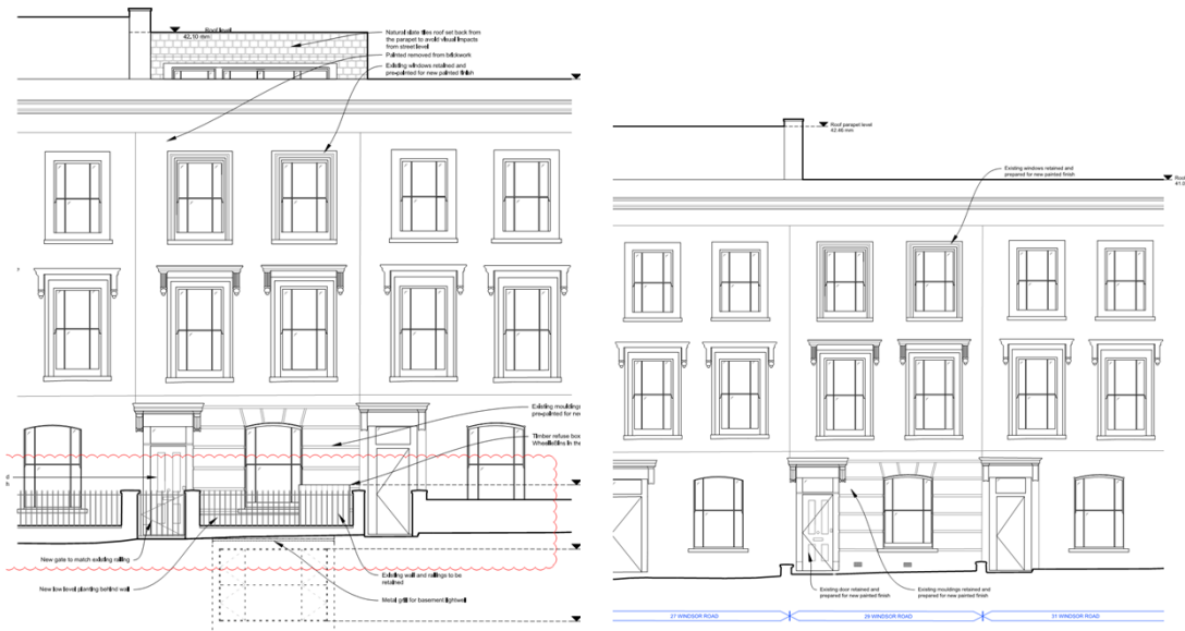
Proposed front view from Windsor Road.