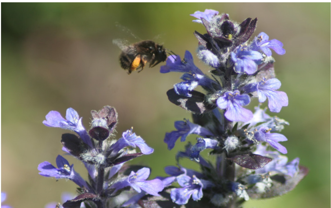
Figure 4. Bees are essential pollinators

Locally, Islington's green infrastructure, including our parks and open spaces, gardens, allotments, railway corridors and street trees, provides a valuable function. It not only makes the borough a greener and more visually attractive place to live but reduces the risk of flooding, improves air quality, provides us with locally grown food, improves health and well-being, and helps to cool urban areas in summer. In all it plays an essential role in the everyday lives of every Islington resident.