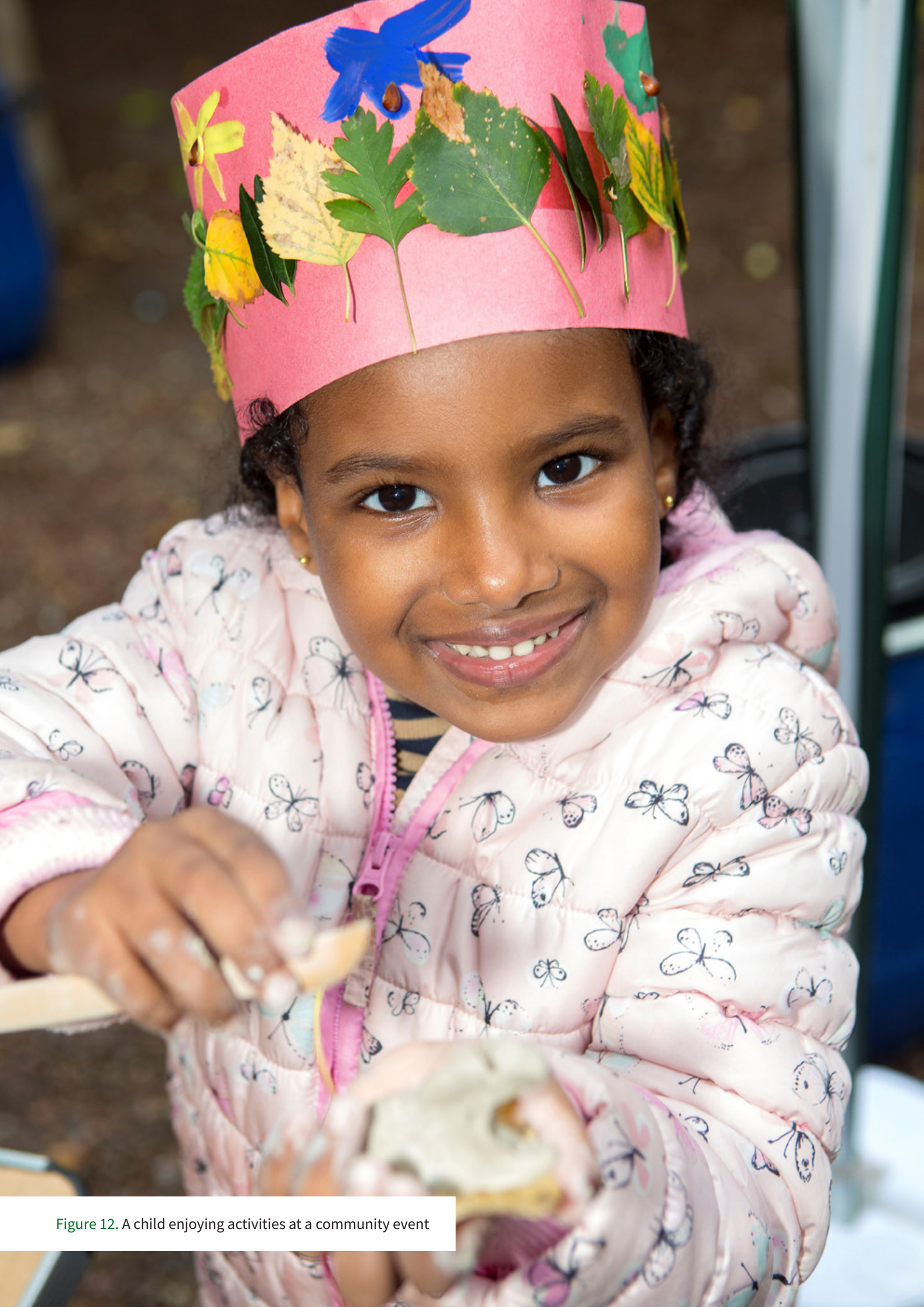
Figure 12. A child enjoying activities at a community event