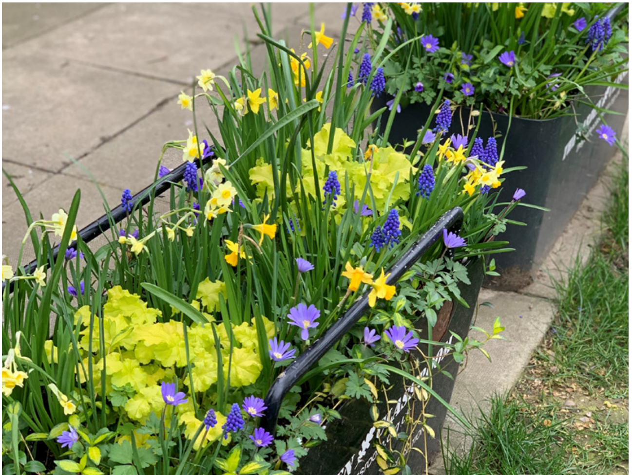
Figure 14. Planters displaying wildlife-friendly plants in Newington Green

To inform this new BAP, a review of the 2010 – 2013 BAP was carried out. The review looked at how many actions were completed against the various action plans. Whilst progress was made across the board, more was achieved in areas where Islington Council had a greater degree of control, such as parks and open spaces. In areas outside of Local Authority control, such as rail side land, it was far harder to achieve targets. In order to ensure that this new BAP is deliverable, this will be a key consideration in where we concentrate our efforts.