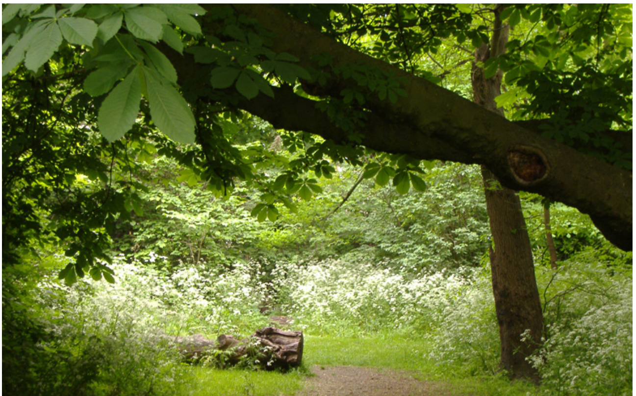
Figure 7. Barnsbury Wood Local Nature Reserve

Islington's biodiversity includes a number of rarities and nationally important species. Examples include the native black poplar, one of Britain's rarest native timber trees; the first recorded sighting in Britain of Lasius emarginatus , an ant species usually found in Europe and the red data book species Nomada lathburiana , a cuckoo bee which is a species of conservation concern.