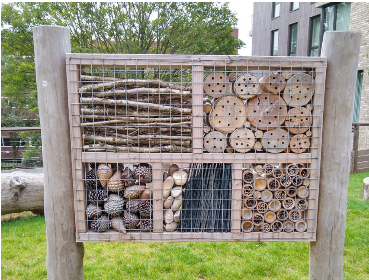
Figure 10. Bug house on a new housing development in Islington