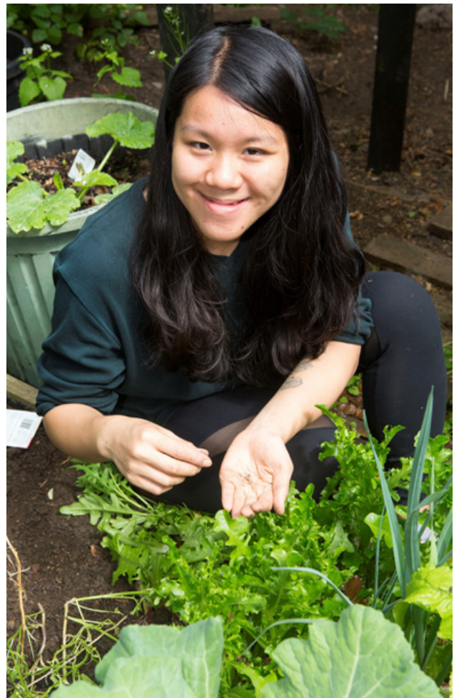
Figure 13. A member of a local gardening group enjoys her harvest

This BAP will contribute to the Council's priority of a fairer Islington, helping to reduce the differences experienced between the poorest and wealthiest residents, promoting community cohesion and ensuring that every Islington resident is able to access and experience the benefits that Islington's wildlife and wild spaces provide.