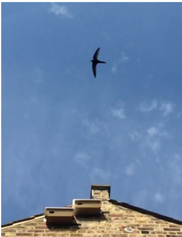
Figure 9. Swift and swift boxes

The London BAP contains targets to improve the condition and increase the extent of a selected number of habitats and species found in the capital. The plan identifies 214 priority species that are under particular threat in London.