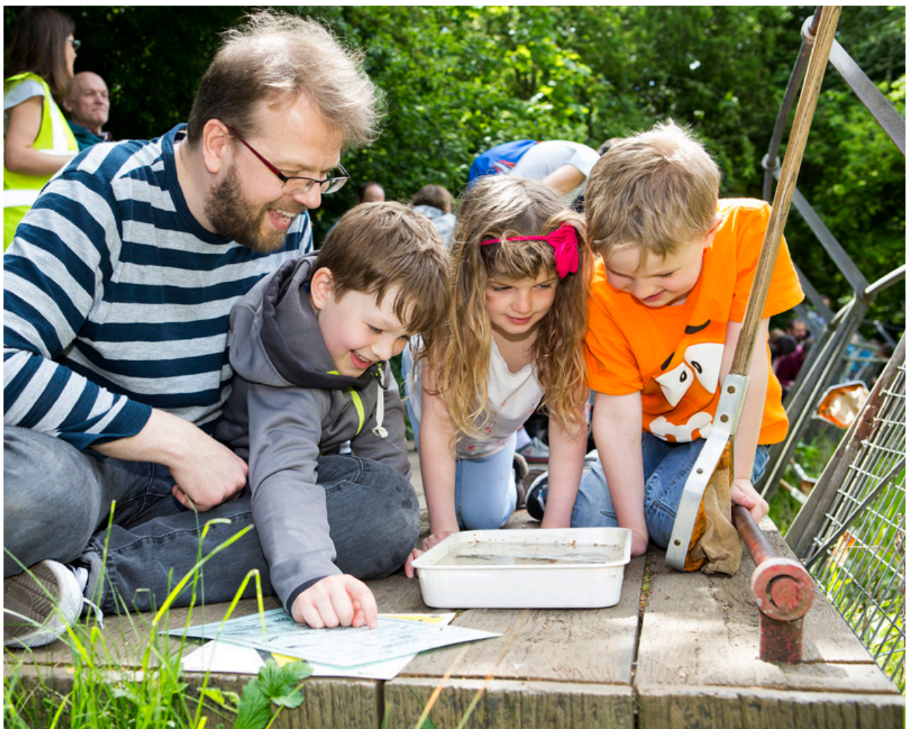
Figure 1. Family pond-dipping in a wildlife pond

the communities, habitats and ecosystems in which they occur. It is not just about the rare and the threatened. As important, is the wildlife we see and experience every day and which contributes to our quality of life and enhances the environment in which we live.