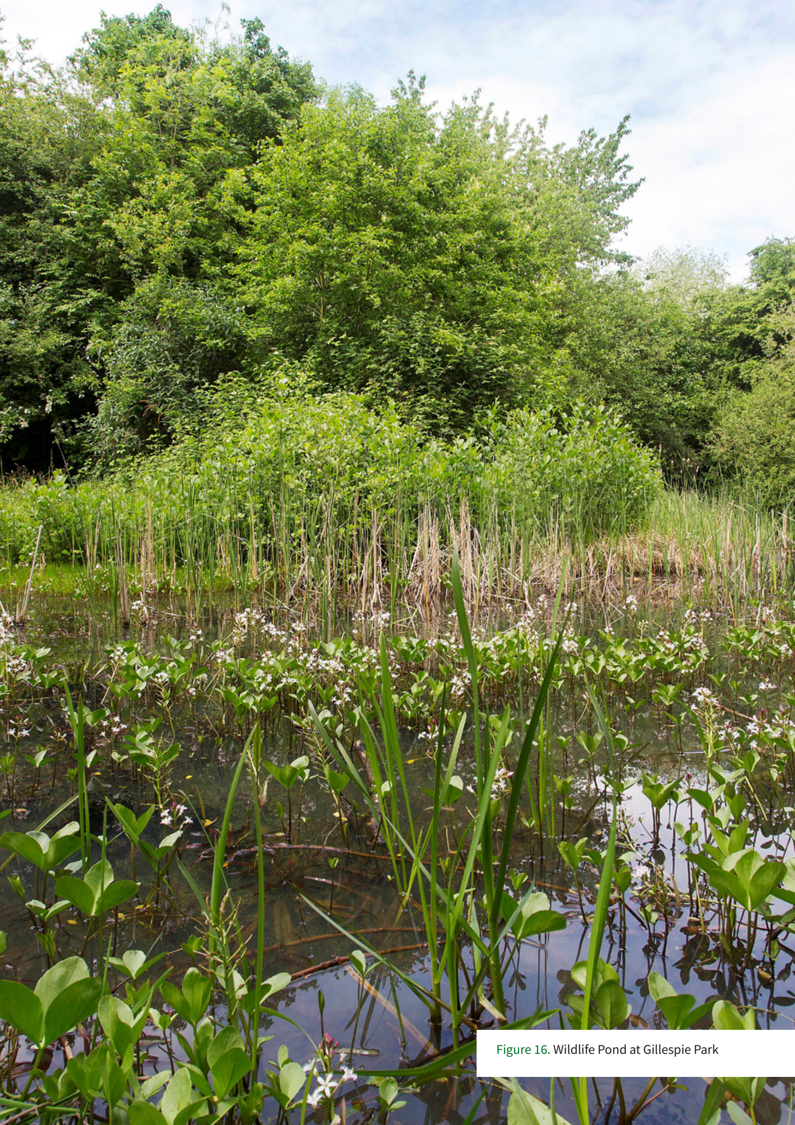
Figure 16. Wildlife Pond at Gillespie Park