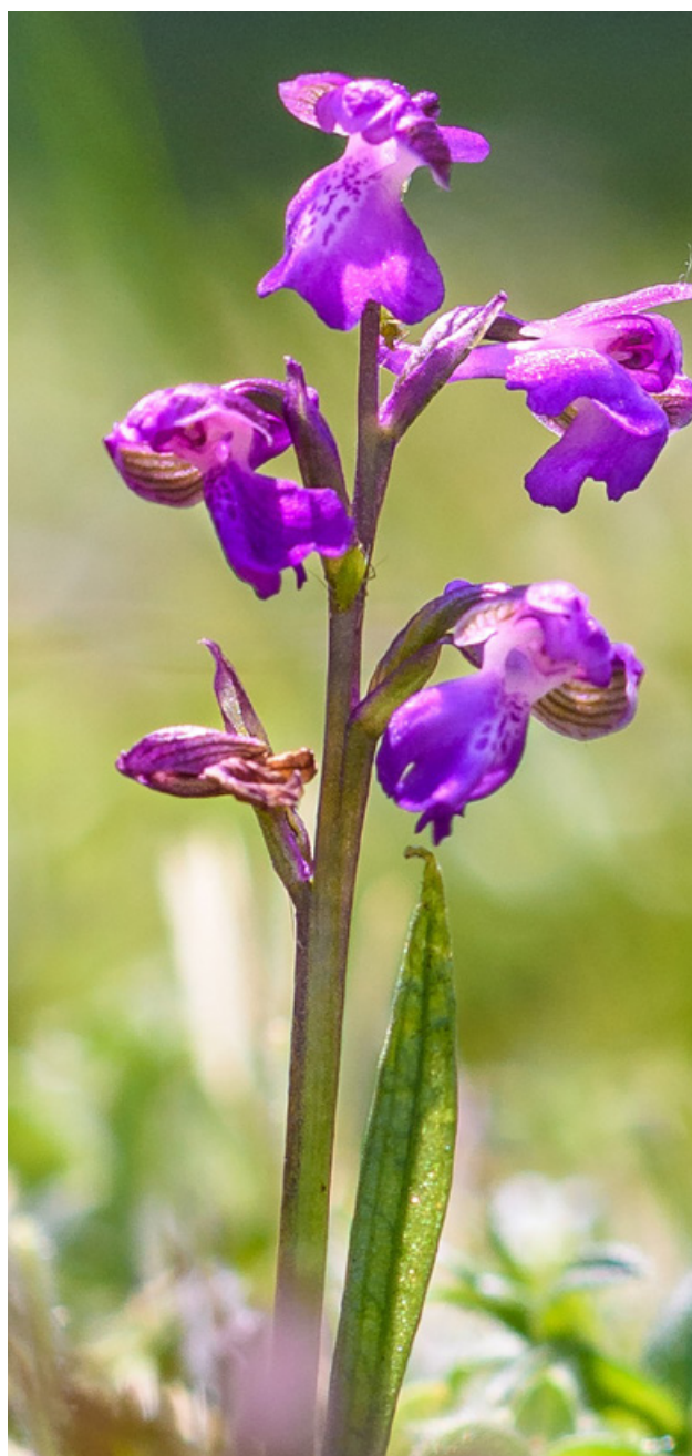
Figure 5. A rare Green Winged Orchid found on the green roof of a council building in Islington

The “Biodiversity Duty” of the Natural Environment and Rural Communities (NERC) Act 2006 requires that “every public authority must, in exercising its functions, have regard, so far as is consistent with the proper exercise of those functions, to the purpose of conserving biodiversity”. This Biodiversity Action Plan is the mechanism by which Islington Council aims to fulfil its ‘Biodiversity Duty’ by highlighting priorities and opportunities for protecting and enhancing the borough's biodiversity.