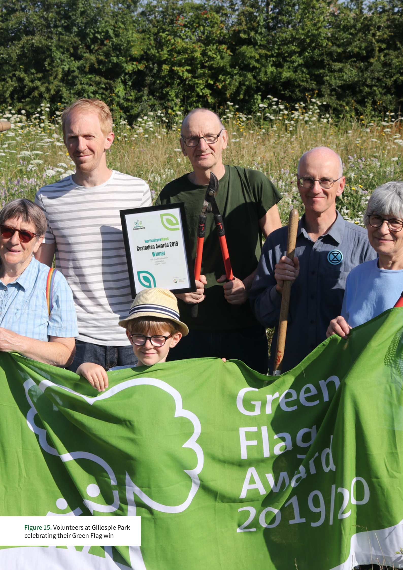
Figure 15. Volunteers at Gillespie Park celebrating their Green Flag win