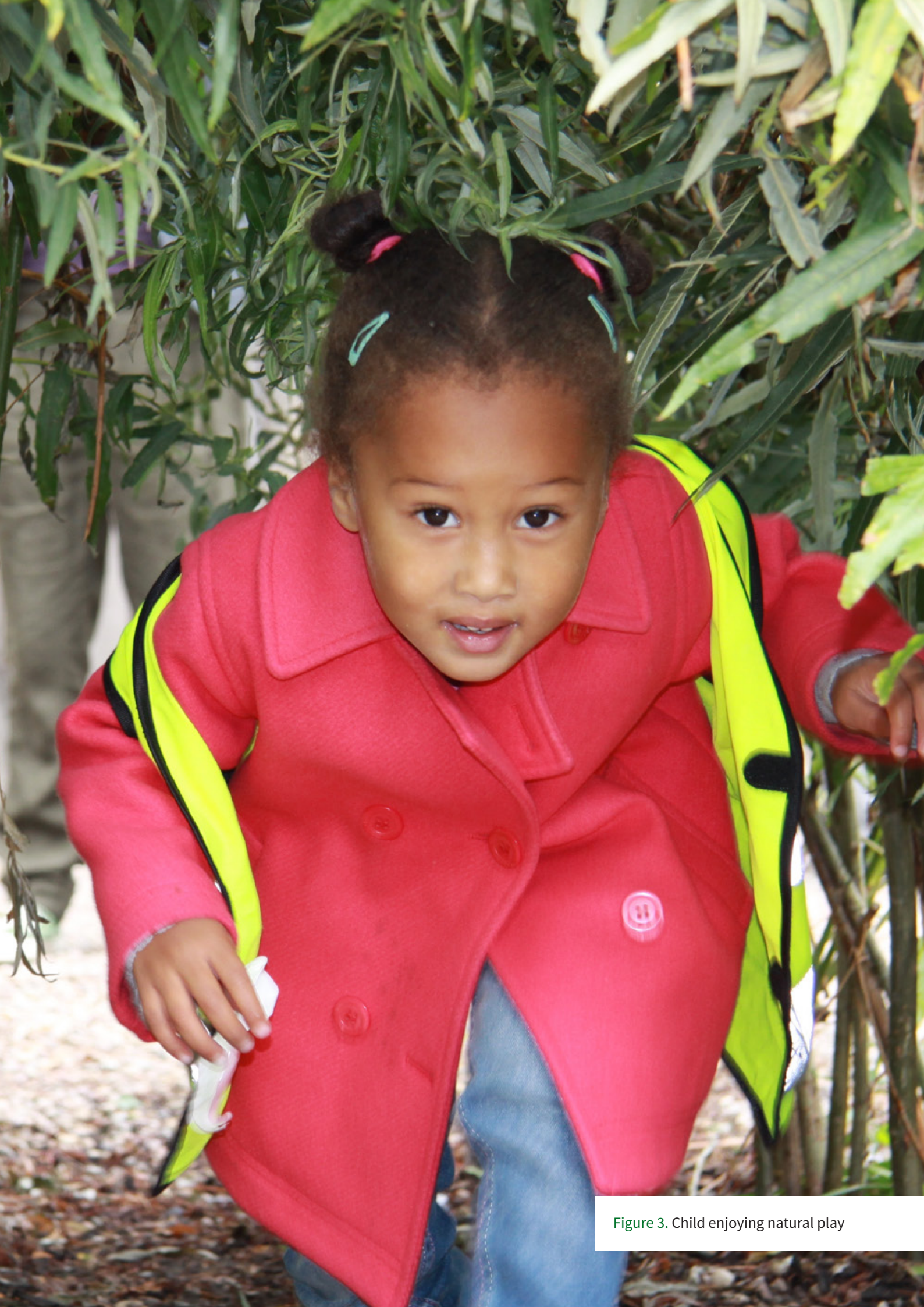
Figure 3. Child enjoying natural play