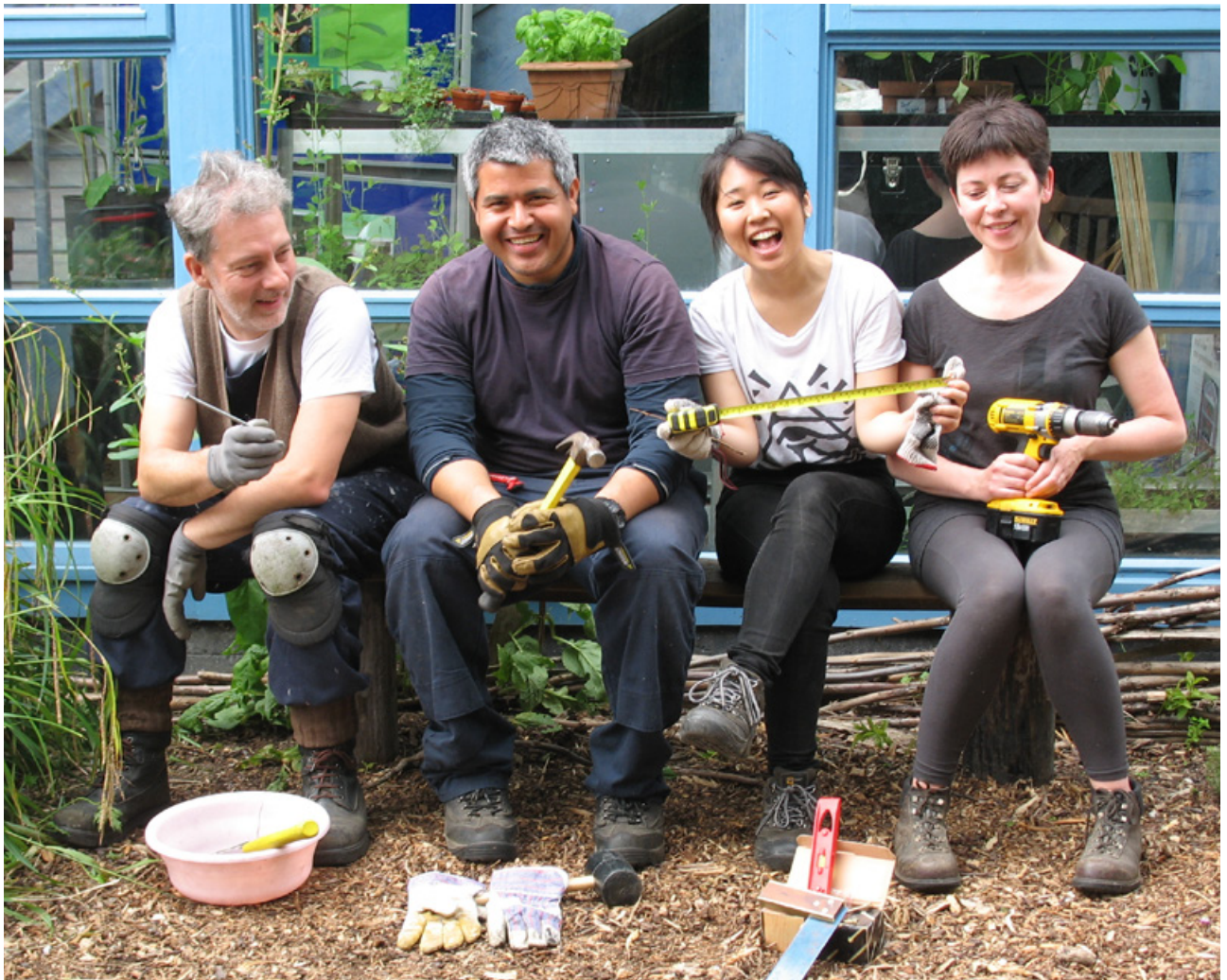
Figure 2. Local residents volunteering at Gillespie Park nature reserve

areas of England. The gap in healthy life expectancy between the least and most deprived areas of Islington is 7.7 years for women and 10 years for men. It is estimated that 20% of Islington adults are obese and 36% of children in Year 6 (aged 10 to 11 years) are classified as overweight or obese, which is worse than the average for England.