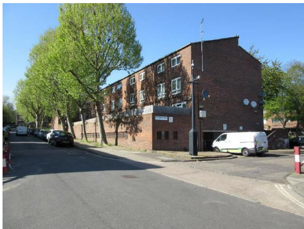
Image 3: View north on Mulhern Road facing south elevation of 1-17 Westacott Close