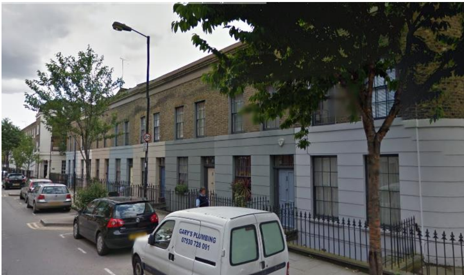
Image 1: Front elevation of the locally listed terrace at Wharfedale Road looking east