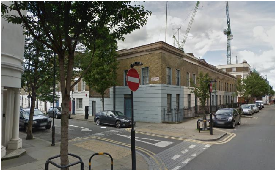
Image 2: View towards the terrace from the junction with Northampton Street