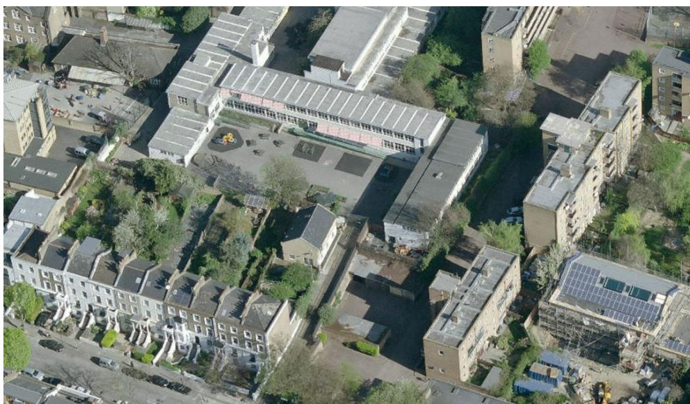
Image 1: Aerial photograph showing the southern most section of the site where the proposed storage container will be located