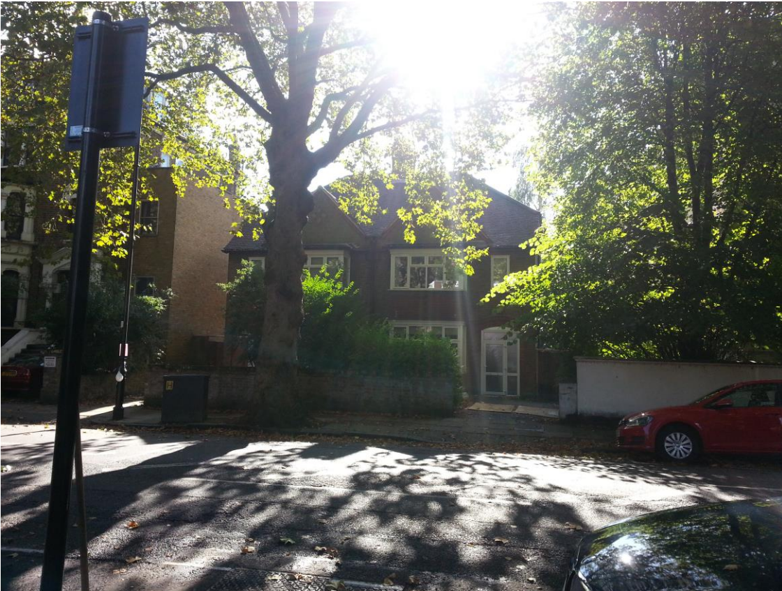
Image 2, the Eastern Neighbour, No 137