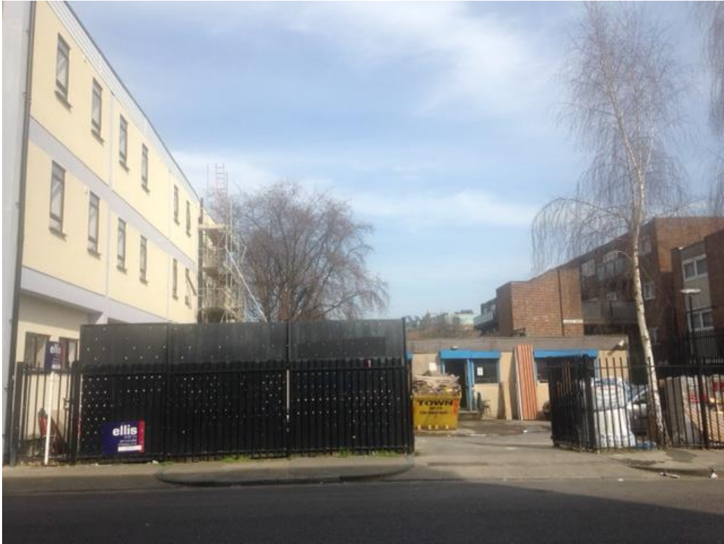
Image 2: Relationship with neighbouring properties in Ecclesbourne Road